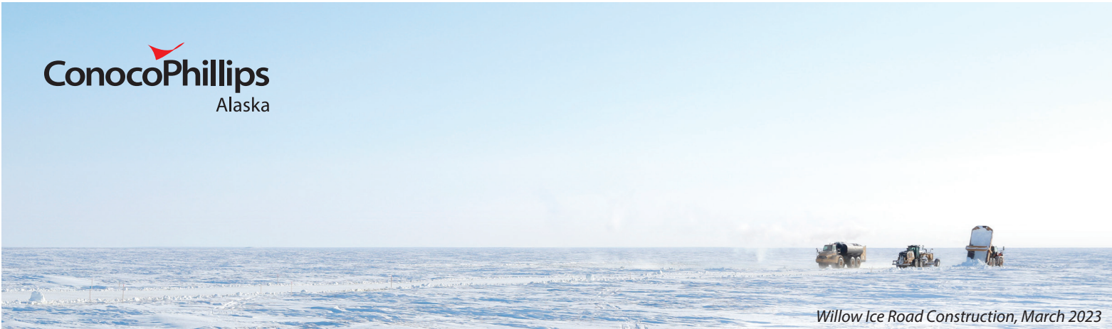
Willow Ice Road Construction, March 2023