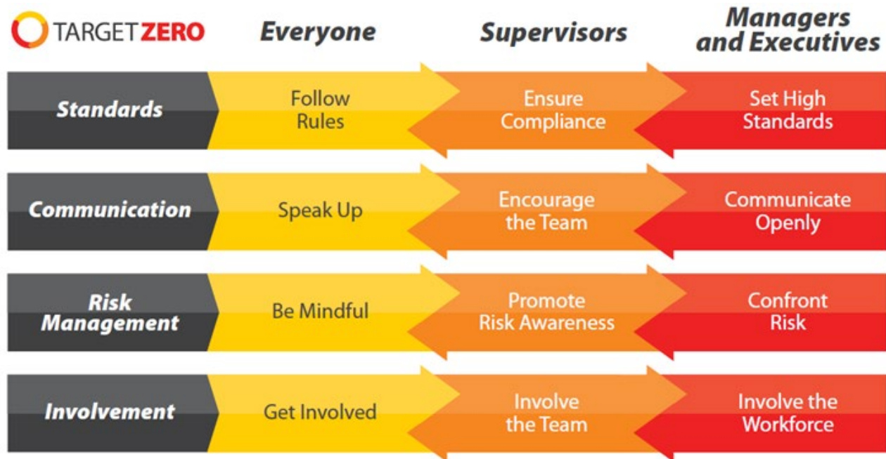
Figure 4.3: ConocoPhillips HSE Culture Expectations