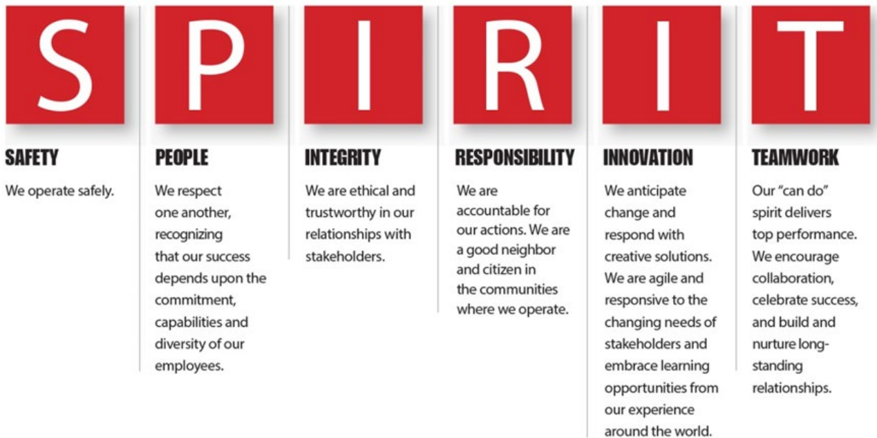
Figure 4.1: ConocoPhillips SPIRIT Values

The Company’s global SPIRIT values of Safety, People, Integrity, Responsibility, Innovation and Teamwork set the standard for how we behave and drive our business culture. All personnel are expected to align to these values when performing work at the Company’s sites.